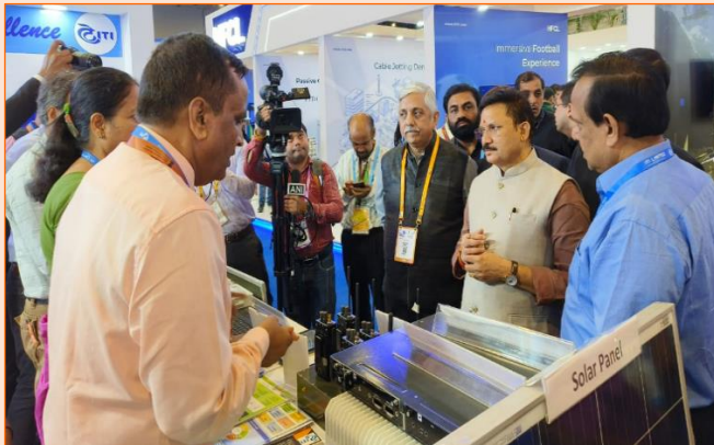
Shri Devusinh Chauhan, Hon'ble Minister of State for Communications visits ITI Stall at India Mobile Congress 2023, New Delhi

ITI Limited participated in the event and showcased its Products like OFC, HDPE Duct, Solar Panels, Telecom product portfolio of 4G RAN, GPON, Encryptors for Defense, Laptops & Smash PCs under 'Aatmanirbhar Bharat', 'Make in India' and 'Digital India' initiatives of GoI. Hon'ble Minister of State for Communications, Shri Devusinh Chauhan, Dr. Neeraj Mittal, Chairman Digital Communications Commission (DCC) & Secretary (Telecom) and delegates from the industry visited ITI stall and had glimpses of the products displayed.