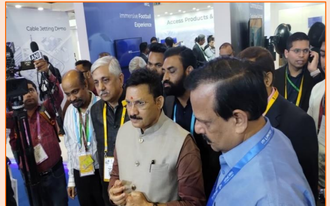
Shri Devusinh Chauhan, Hon'ble Minister of State for Communications Visits ITI Stall at India Mobile Congress 2023, New Delhi